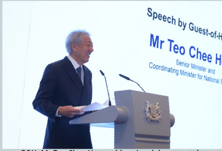
GOH, Mr Teo Chee Hean addressing delegates at the WES 2023 Opening Ceremony on 8 November