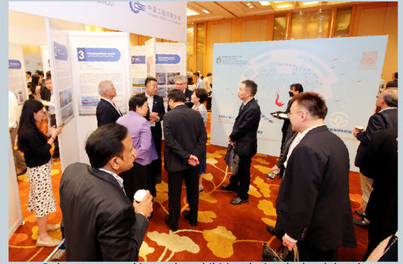
Delegates networking at the exhibition during the lunch break