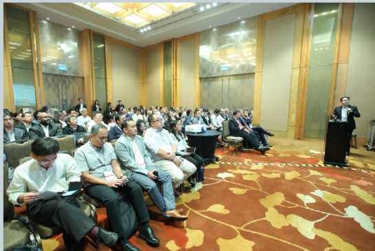
Enthusiastic participants engaged in the track room