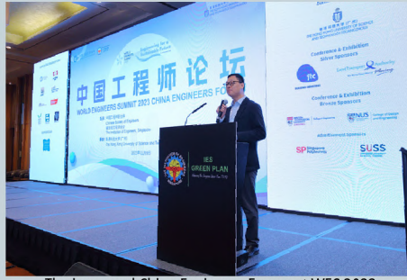
The inaugural China Engineers Forum at WES 2023 on 9 November