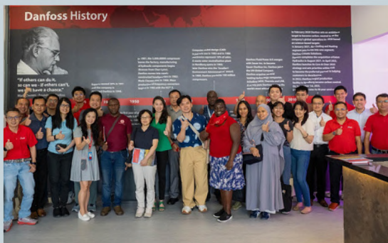
Both local and overseas delegates learned more about Danfoss Integrated Technology at their Sustainability Technology Center